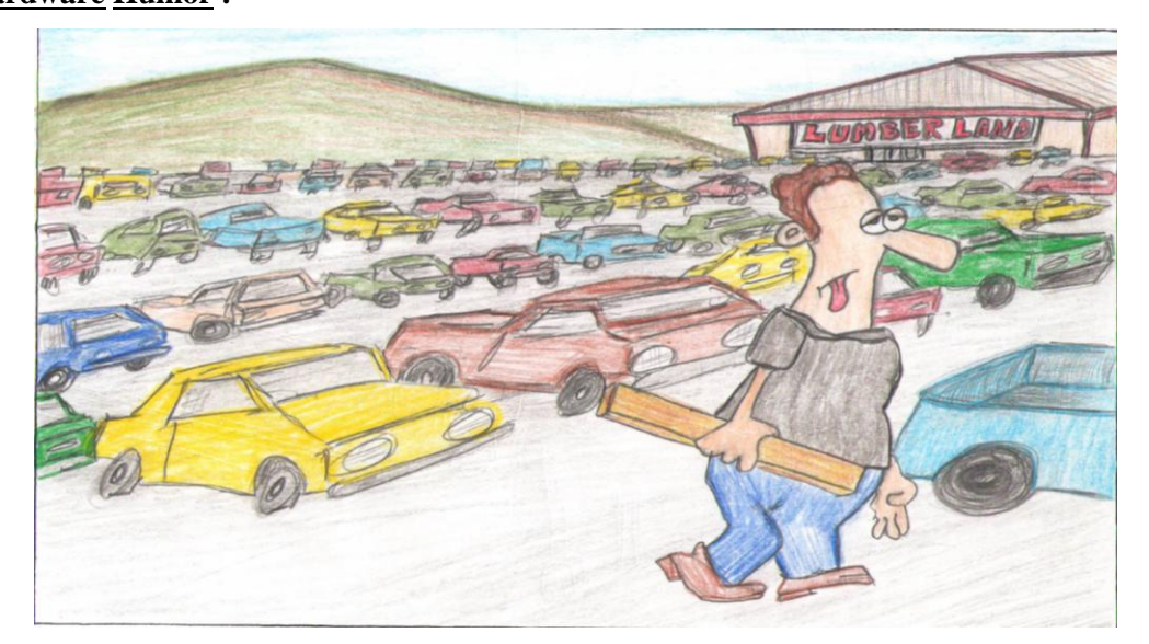
Henry thought the 2 miles he would have to walk shopping at the big box would be good exercise, but he didn't realize it would take an extra 2 hours.