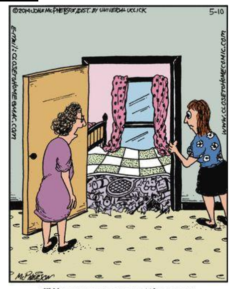
"We gave up on getting our daughter to clean her room, so we just laid linoleum over all the junk."